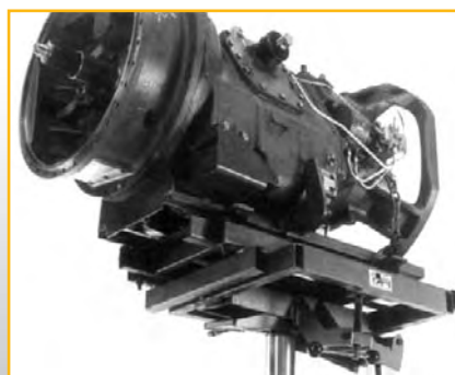
Multi position swivel head included