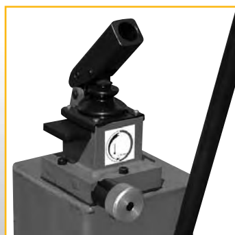
Speed manual pump